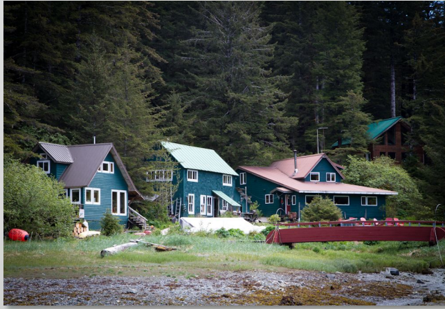
Inian Islands Institute

Join us in a week-long, immersive course for adults – a journey into the heart of the Alaskan wilderness and into the science and solutions of climate change.